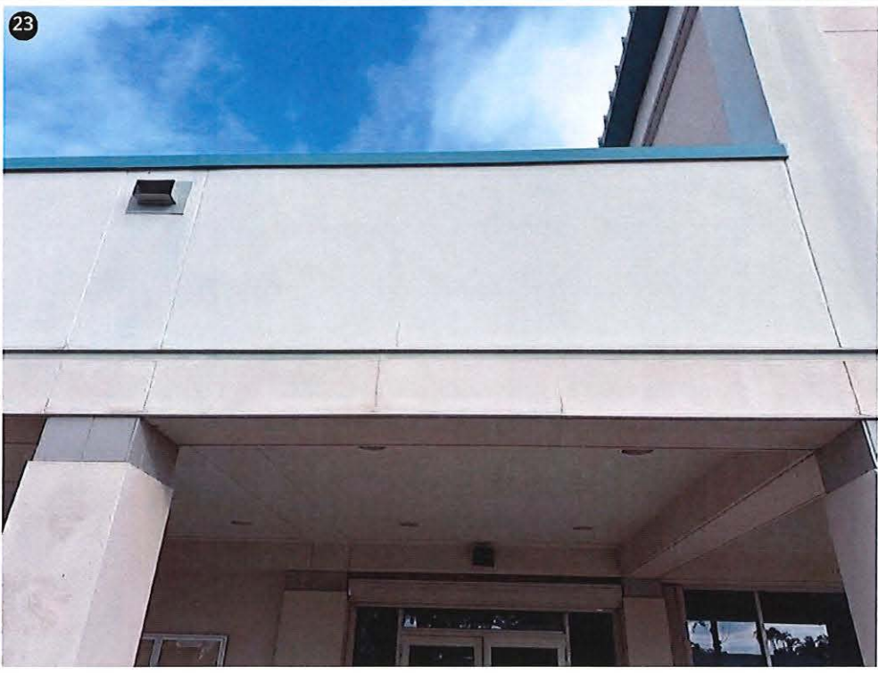
Minor voids observed throughout the exterior